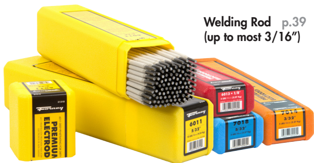
Welding Rod p.39 (up to most 3/16")