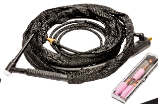
TIG Torch CAT# 85658

SEE OUR FULL LINE OF METALWORKING ACCESSORIES