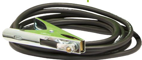
Ground Clamp CAT# 85668