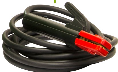
Electrode Holder CAT# 85670