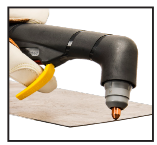
Drag torch while holding at a 15-30° angle