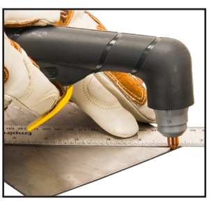
• Use a metal straight edge to control cuts